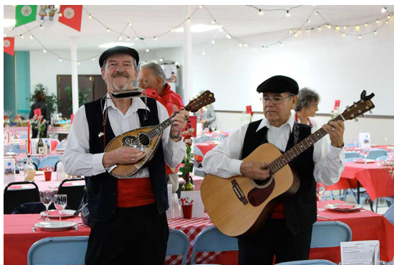
The Tarantellas, performing Italian songs.