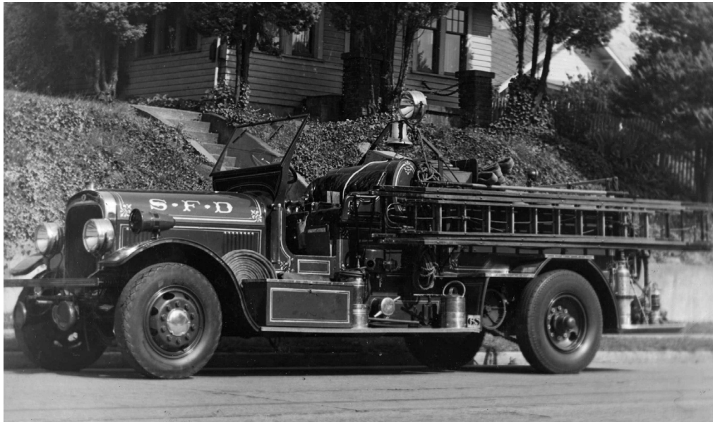
Hillman Fire Station's Engine 28, a 1924 Seagrave 800 GPM pumper, was the first to respond to the 4/14/1941 fire.