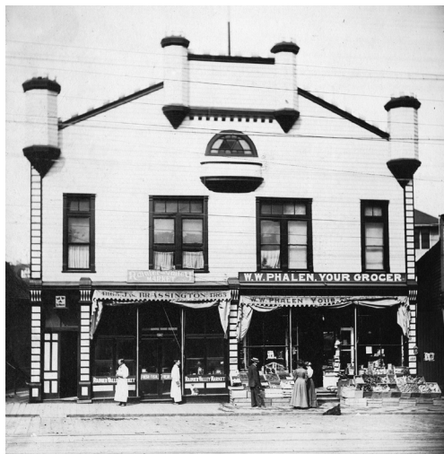
The earliest fraternal lodge hall in Columbia City, the Knights of Pythias Hall in 1909.

The history of bread goes back some 30,000 years, to the hunting and gathering phase of human development. Fast forward a few tens of thousands of years to 1891, and a local version of civilized society crafted by Columbia pioneers began to materialize. Lumber and shingle mills as well as the railway attracted workers who needed their daily bread. Historical records indicate several locations for bakeries along Rainier Avenue between Edmunds and Hudson Street, the two-block stretch originally designated as the business district.